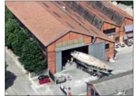
CNB's main building, with the Frers 76' Vivant being hauled out for launching.

CNB shipyard is situated 5 minutes from the historic center of Bordeaux on a site housing four buildings (129, 000 sq. ft.) and dedicated to naval construction for over a century. The complex is at the edge of a 1,000 ft. deep water quay. The main building is equipped with six