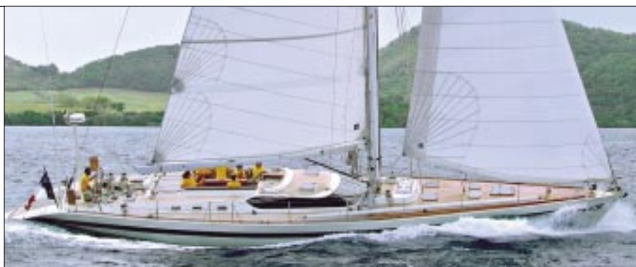
Narval II ▲

designed by Philippe Briand, built by CNB. Launched in december 91. Exceptional cruising yacht in excellent condition. 4 double guest cabins plus crew, all with ensuite baths. Cummins 116 hp