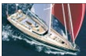
Blues, CNB 70