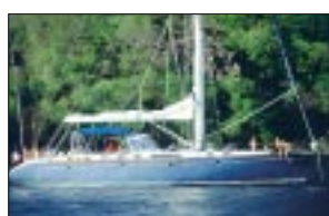
Caresse, Bénéteau 62