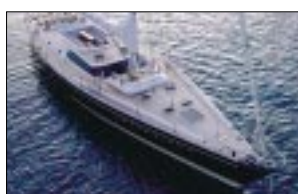
Grand Bleu II, CNB 76