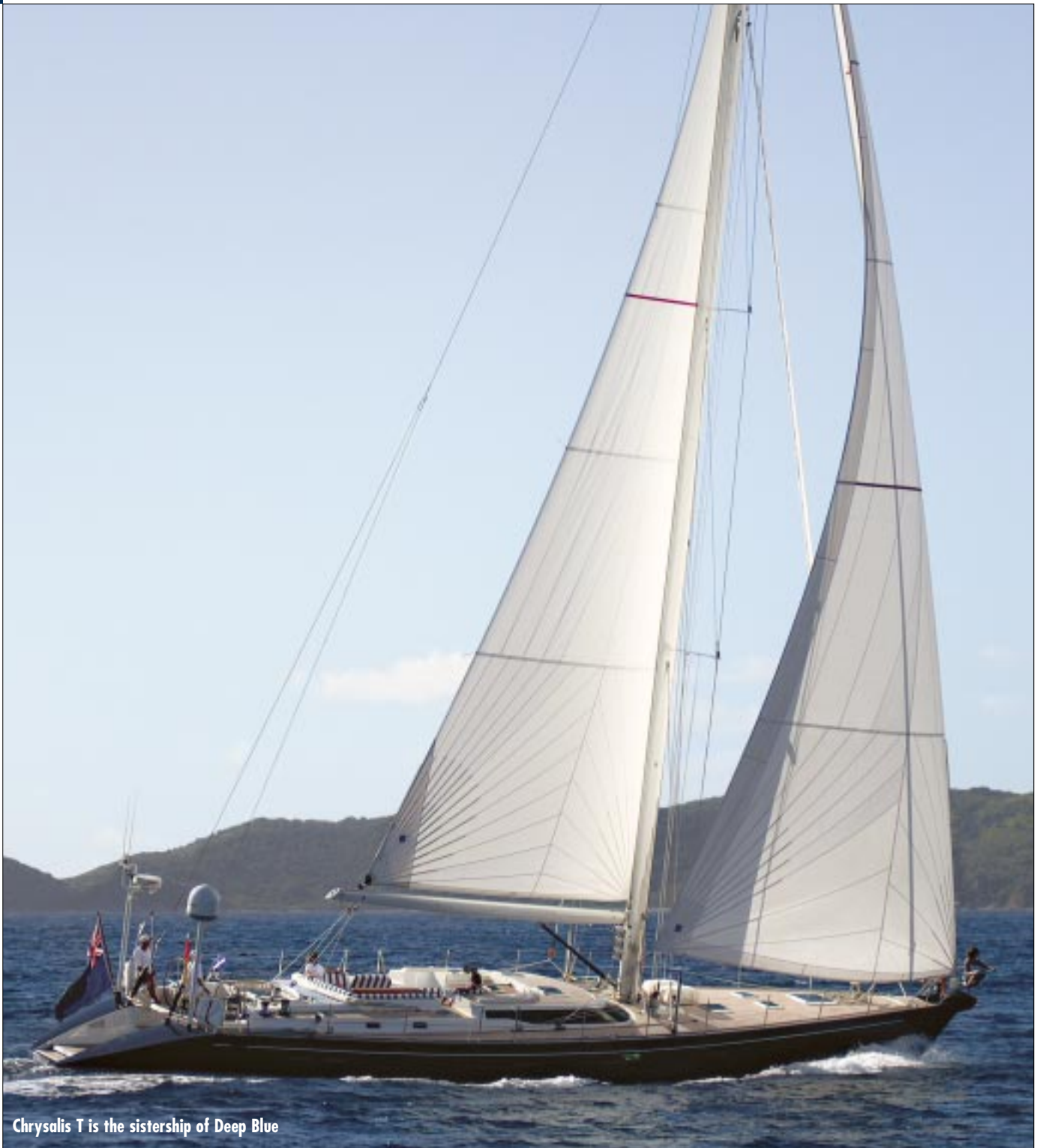
Chrysalis T is the sistership of Deep Blue