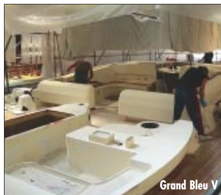
Grand Bleu V

The aluminum construction schedule is full! In the hangar we find: Grand Bleu V (95' Philippe Briand), a 225 passenger power catamaran (27,30m / 89'7" with twin 1200 HP engines) and the CNB 77 #3.