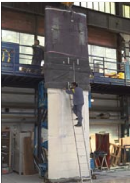
The final adjustments of the composite keel trunk and the stainless keel. The installation of the 30 ton bulb is completed when it is in place in the yacht.