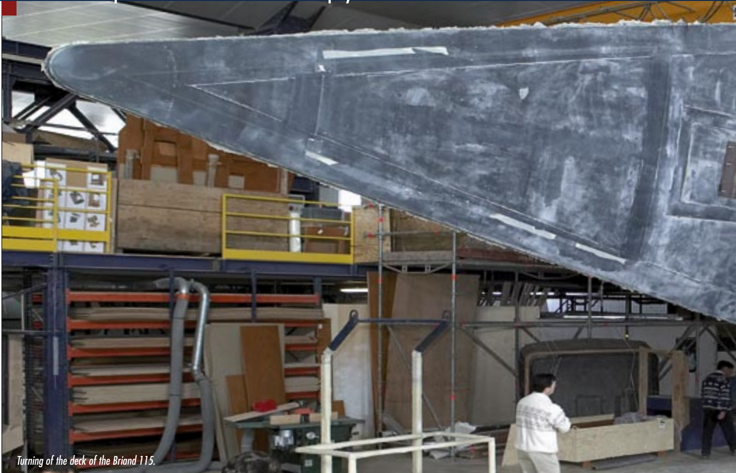
Turning of the deck of the Briand 115.