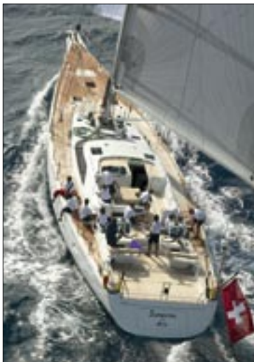
As for Simeron (Castro 82), she is distinguished by her victory against the finely honed La Boomerang III.