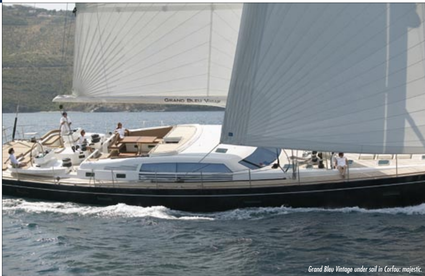
Grand Bleu Vintage under sail in Corfou: majestic.

Launching: April 2003 • Architect: Philippe Briand • Aluminum • L.O.A.: 95 ft • Owner + 3 guest ensuite double cabins + 2 double crew cabins.