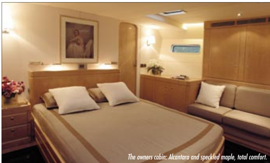
The owners cabin: Alcantara and speckled maple, total comfort.

CNB is the central agent for this sale. For more information, contact your broker or CNB.