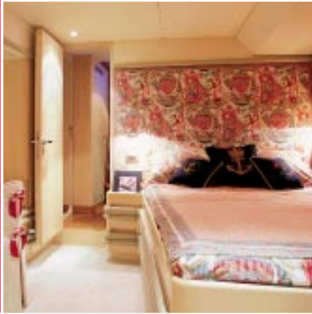
Bottom right: Opposite view of owner's state room.