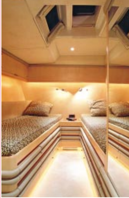
Top right: Two double guest's cabin and owner's state room.